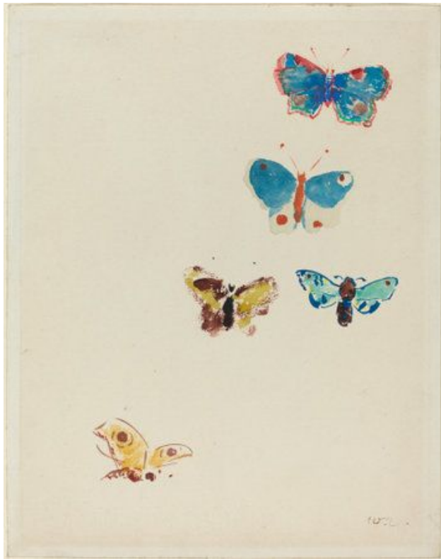
Odilon Redon: Five Butterflies 7